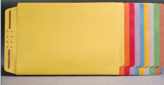
Overall + 1 3/4" Flap