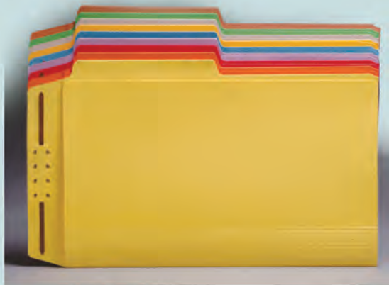
Overall + 1 3/4" Flap