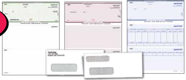
Single and Double Window Envelopes