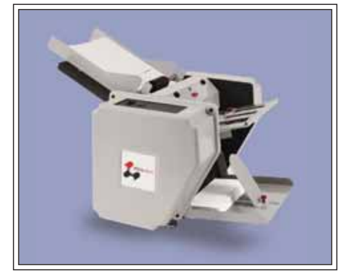
The PSM3000 is an affordable desktop solution providing a good fit for small business looking to streamline their document processing. Designed for low volume mailings, this folder/sealer has a processing throughput of up to 3,000 forms per hour (PSM3000C includes counter).