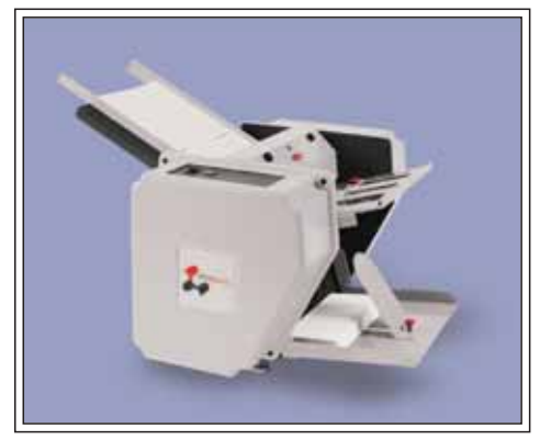
The PSM1800 makes pressure seal a viable option for small business. It brings all the pressure sealer capabilities to customers processing as few as 6,500 documents per year. It folds and seals all popular fold types with adjustable fold plates.